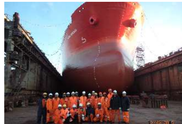
Team Nave Dorado in Dry dock