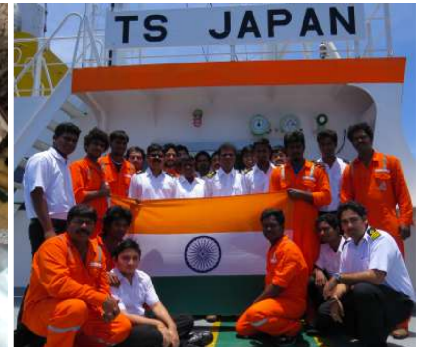
Independence Day celebration on-board TS Japan