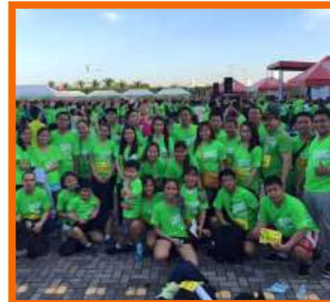
Synergygroup Operations Inc. (SGOI) Races for life.