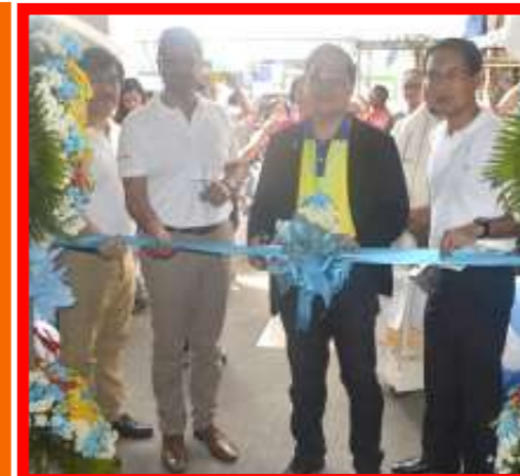
SGOI branch office inaugurated at Iloilo by City Mayor Jed Patrick Mabilog.