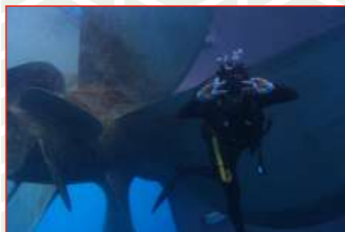
Underwater photograph of a diver with ship's propeller.